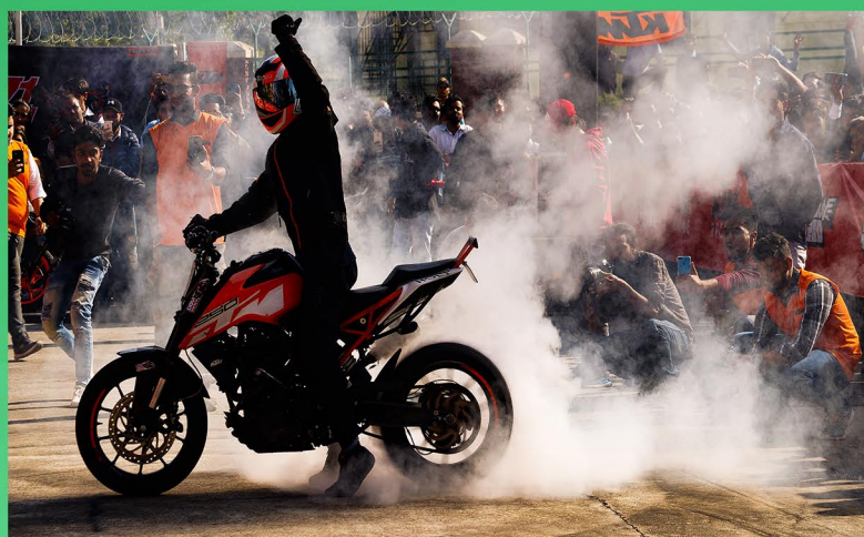
KTM stunt show