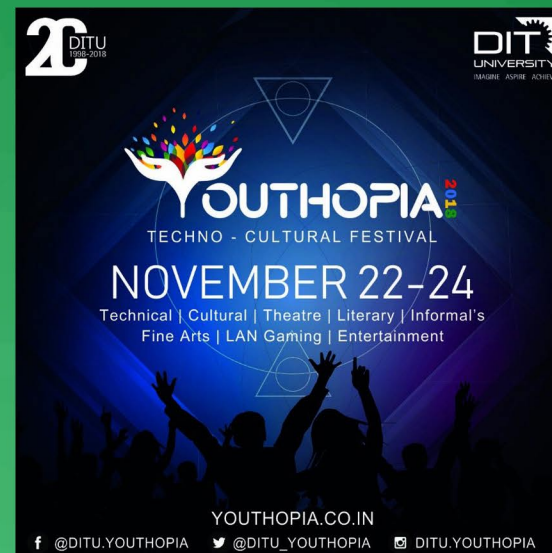
Youthopia 2018 Poster