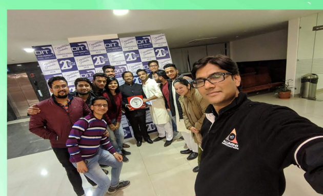
The esteemed Alumni of DITU