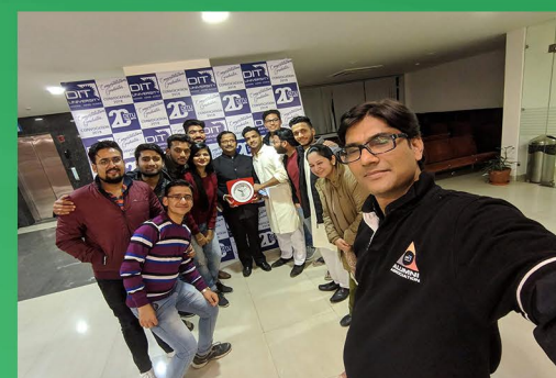
The esteemed Alumni of DITU