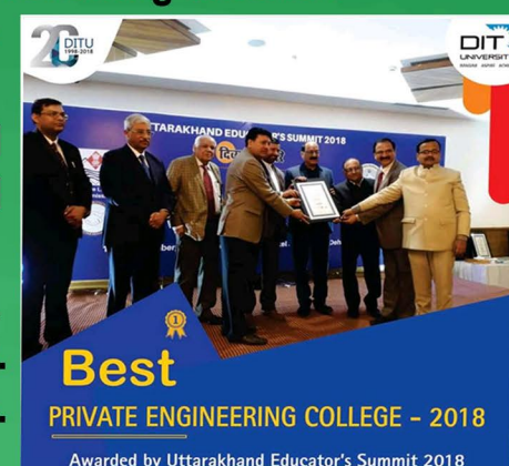
DIT awarded as best private engineering University-2018

The purpose of this academic award was to recognize outstanding performance of some of the best institutions in the state of uttarakhand. Thus DIT University emerged as the best engineering University 2018, by proving its merit and constantly striving to give the best to its students.