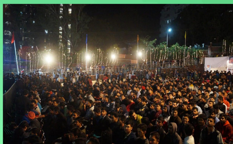
Students dancing to the beats