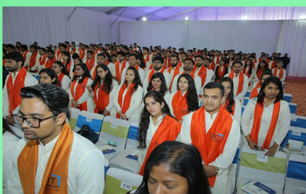
Student Attending Convocation