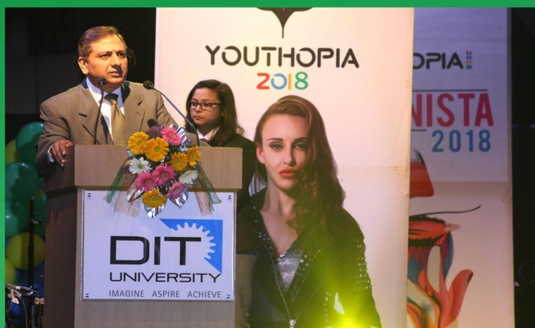
VC sir addressing the students during Youthopia