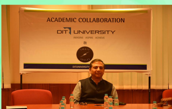
VC sir attending the Smart Joules workshop