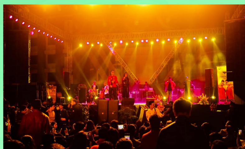
Star Night of Youthpia