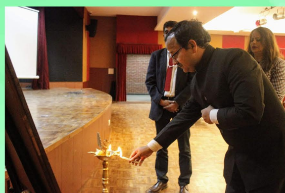
Lamp lightening during the Alumni Meet