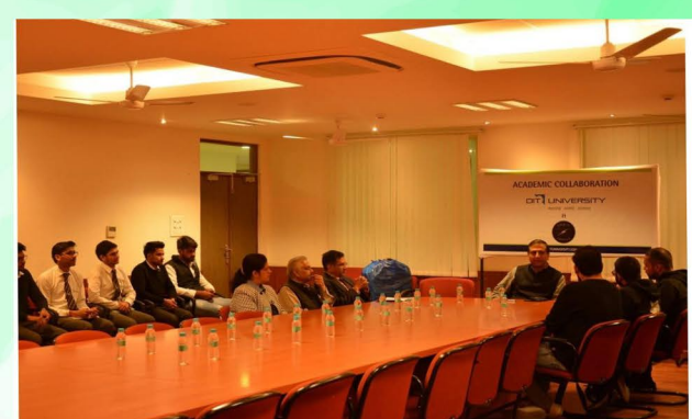
Smart Joules Workshop