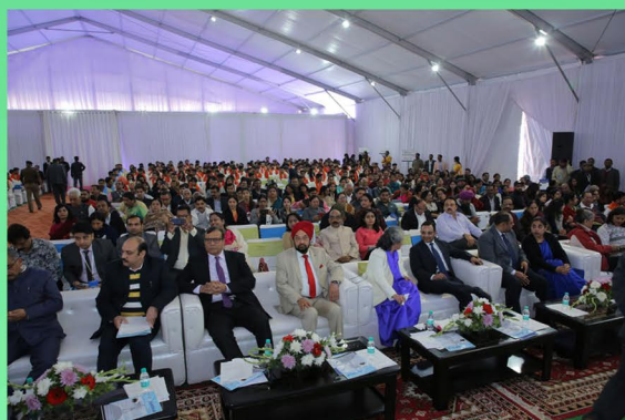
Second Annual convocation