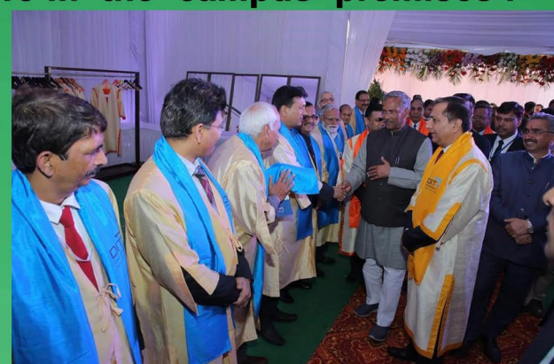
Annual Convocation 2018

A scintillating award ceremony was also part of the Convocation, with awarding the coveted gold medal to the student who topped all the branches. Several other awards were also distributed. The graduates were also awarded certificates by the Senate and other dignitaries. Then the gold medalist DITian lead all the graduates taking the academic pledge. The Convocation ended with a vote of thanks, followed by the National Anthem sung by the students of the university.