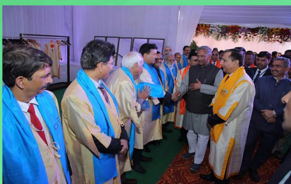
Welcoming the chief guest during the Convocation