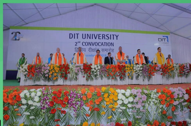
Dignitaries attending the convocation