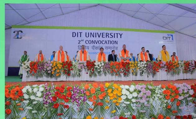
Dignitaries attending the convocation