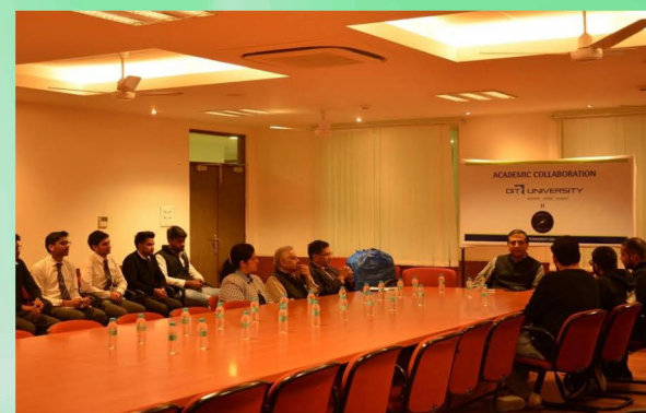
Smart Joules Workshop