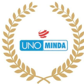
Award of Excellence for Most Innovative Idea